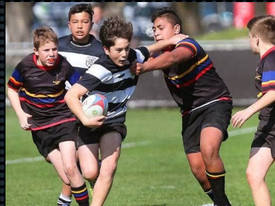
Sport training and matches