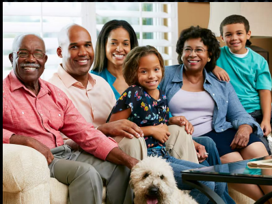
Visiting family or friends