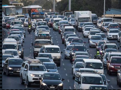
Commuting to work