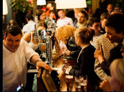
Eating or drinking out