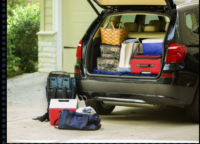
Back & weekend getaways