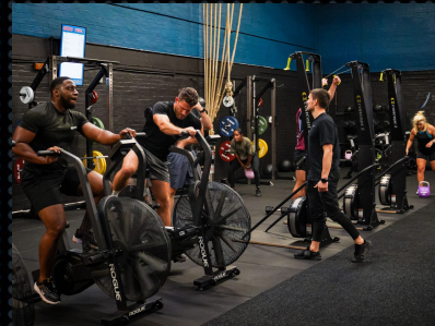
Gym and exercise