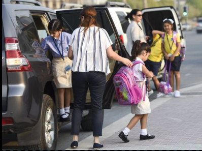
Dropping children at school

Because most of the travel people do is not seasonal and done every day or week